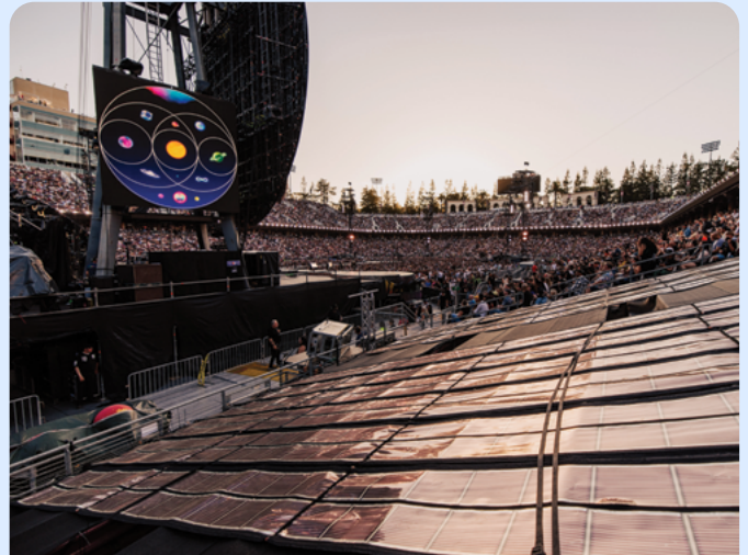
Kardinia Energy: Flexible, printed solar manufacturing