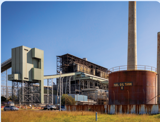
AGL Hunter Energy Hub: Renewable energy generation and grid-scale batteries