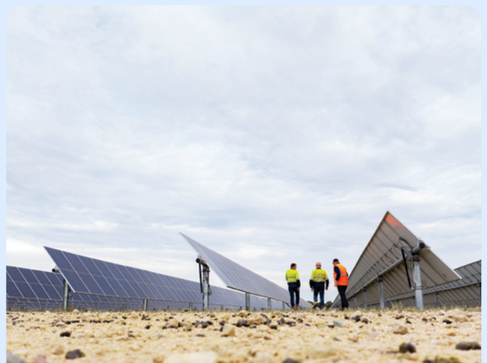
Hunter Valley Solar Foundry: Solar manufacturing