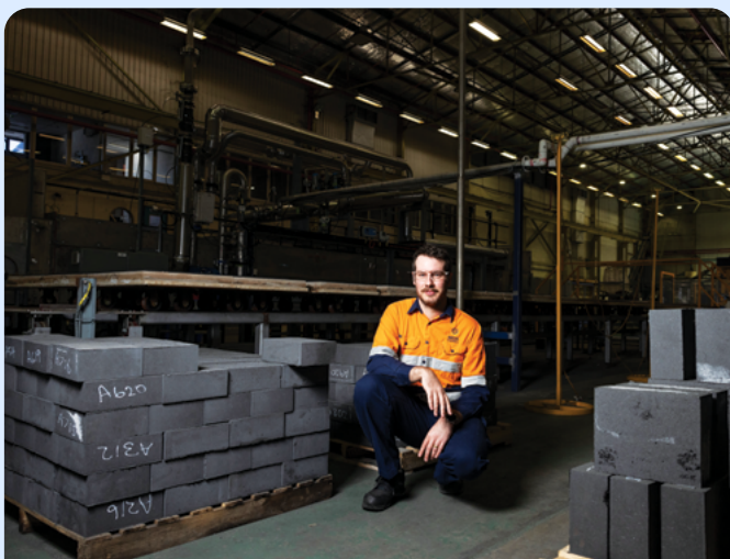
MGA Thermal: Manufacturing and clean energy storage