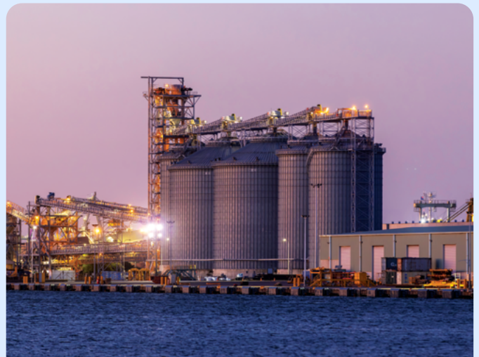
Port of Newcastle Clean Energy Precinct: Hydrogen production and export