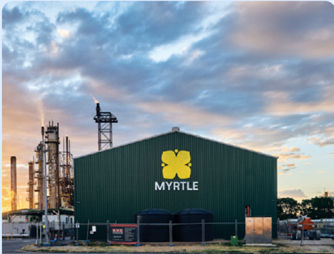
MCi Carbon: Mineral decarbonisation technology